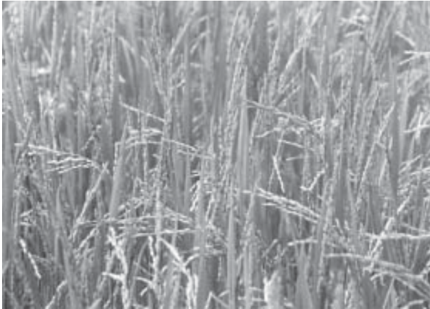
Healthy rice plants with a well developed root system: more resilient against stress.

terized by engaging the farmers as partners in development and farmer-to-farmer dissemination of SRI.