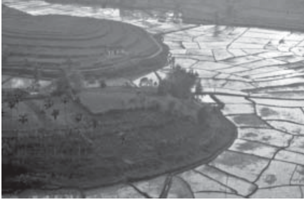
Paddy land near the Red River; adjusting to a decreasing quality and quantity of irrigation water.

would see the benefits of a new irrigation regime wherein they will be able to manage their pattern of water use.